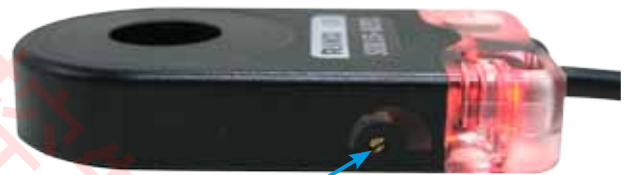
VR 12-turn Adjuster