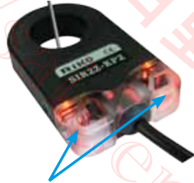
High brightness dual LED.